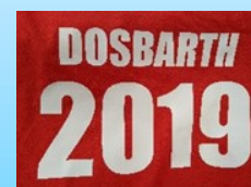
Leavers T-shirt logos, front & back